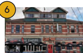
SMOKED GOODS @ EMPIRE HOTEL

80 Emu Bay Road, Deloraine 7304 (03) 6362 2016