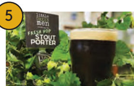
LITTLE GREEN MEN BREWING

30 East Parade, Deloraine 7304 0438 671 418