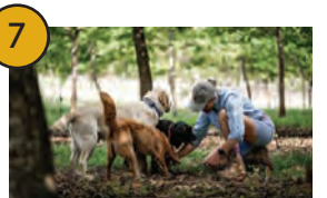
THE TRUFFLE FARM

19 Emu Bay Road, Deloraine 7304 (03) 6362 1029