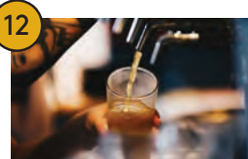
WANDERING TROUT BREWERY

323 Montana Road, Deloraine 7304 (03) 6362 4130