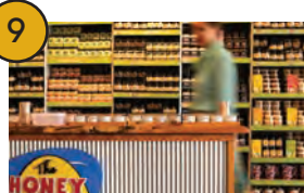
MELITA HONEY FARM

110 Trickett Road, Deloraine 7304 0400 067 093