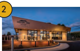
WESTERN TIERS DISTILLERY

127 Hagley Station Lane, Hagley 7292 0482 945 547