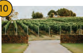
MEANDER VALLEY VINEYARD

39 Sorell Street, Chudleigh 7304 (03) 6363 6160