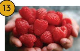
CHRISTMAS HILLS RASPBERRY FARM CAFÉ

100 Pioneer Road, Mole Creek 7304 (03) 6388 9252