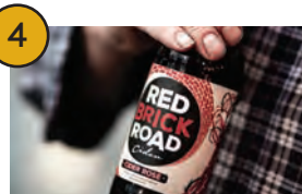
REDBRICK ROAD CIDERWORKS & DISTILLERY

8 East Parade, Deloraine 7304 (03) 6362 1137