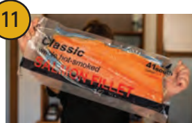
41° DEGREES SALMON

46 Montana Road, Red Hills 7304 0431 645 153