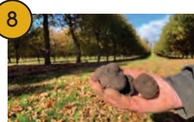
TRUFFLES OF TASMANIA

844 Mole Creek Road, Deloraine 7304 0437 849 283